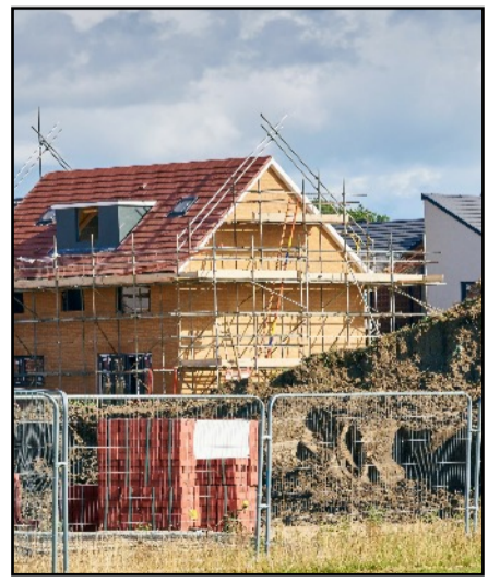
Homes people can afford where the people want them

"We will throw open the doors of the council, making B&NES more open and listening. Our top priorities are to make it easier to get around and to build houses that people can afford where the community wants them."