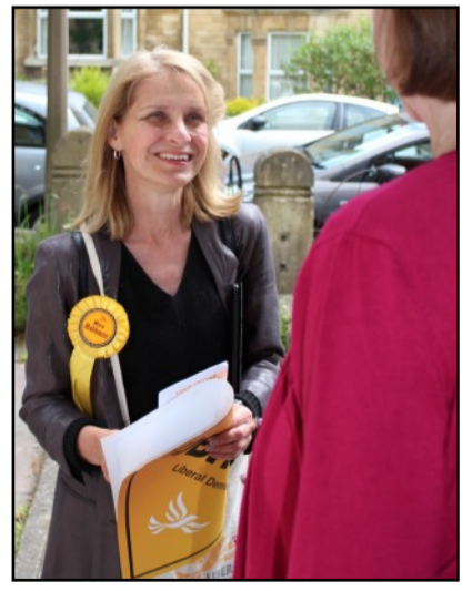
Listening to residents, putting you first