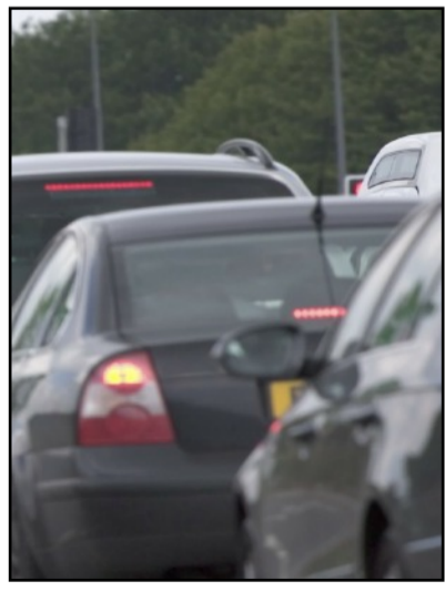
Easier travel and cleaner air