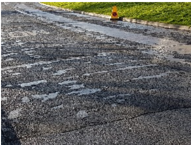
Kelston View before the recent work

We are pleased to see that following the recent meetings with the Highways Team at BANES, the first phase of work on Kelston View has been delivered, which was the Micro-asphalting from The Hollow to North Way.