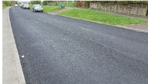
Kelston View after the recent work

We have also had confirmation that the section of Kelston View from the junction with Wedgwood Road around to Haycombe Drive has been scheduled to be repaired in June.